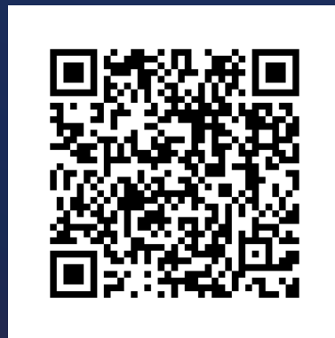
Scan QR Code to check if your state offers pre-registration

Once you turn 18 years old, your name will be moved from “pending” and “pre-registration” status and automatically switched to “registered” voter.