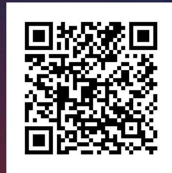
Scan QR code to check your registration status

01 | Make sure you are registered to vote! If not, follow our steps above, or follow our guidelines for individual states. Vote.org and the U.S. Vote Foundation are great places to check and confirm your voter registration status.