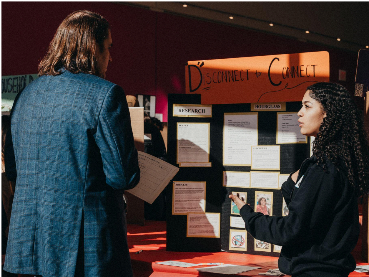
Image Description: A Generation Citizen student presents their Civics Project, on a tri-fold board entitled "Disconnect to Connect", to a Community Advisor at Oklahoma Civics Day, December 2024